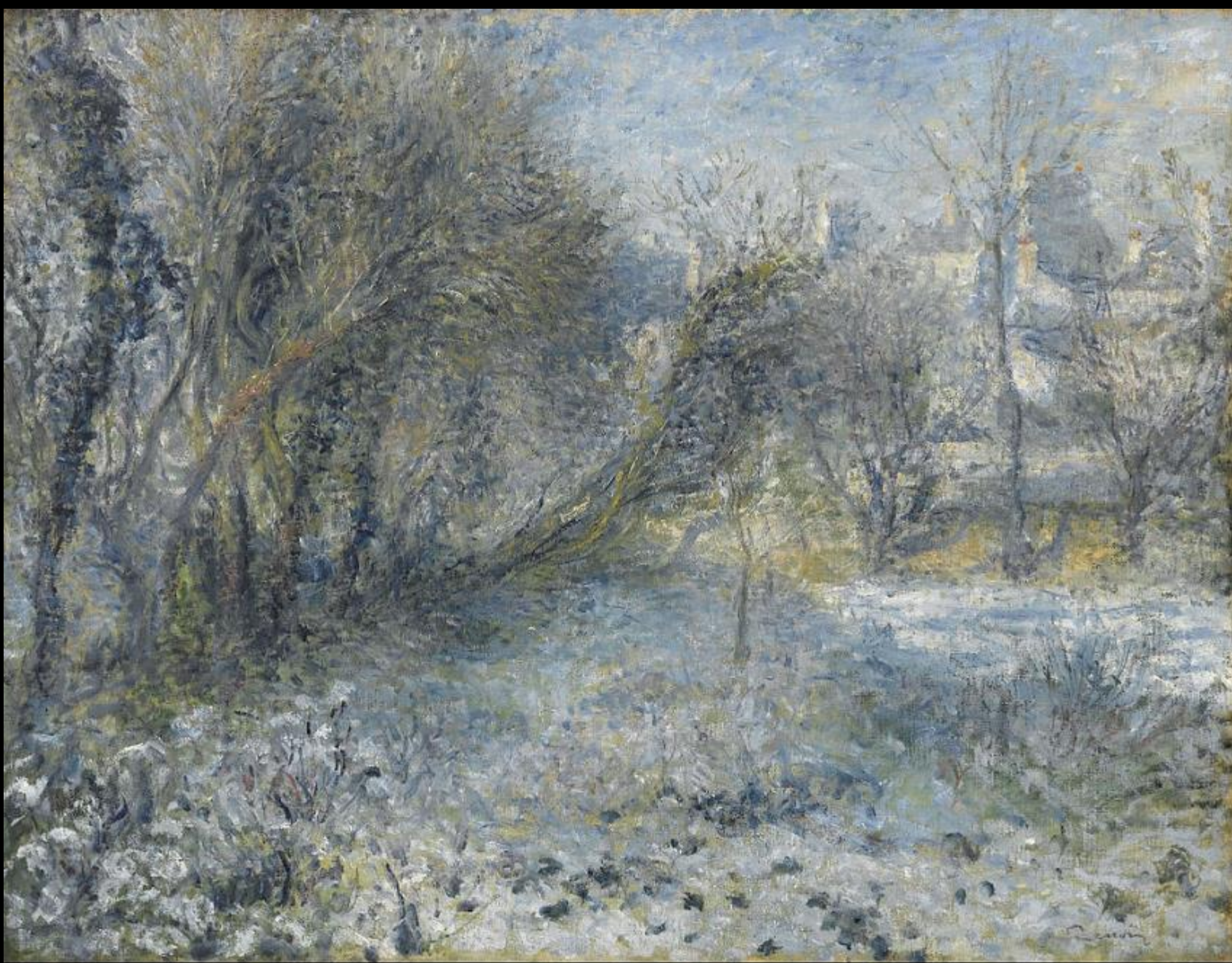
Snow-covered Landscape -- Pierre-Auguste Renoir, Musee de l'Orangerie, Paris, France