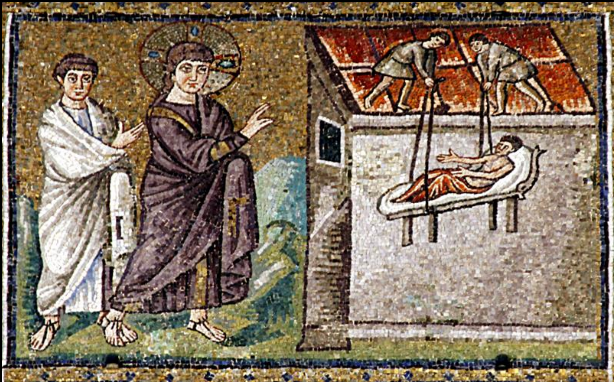
Jesus Healing the Paralytic, Sant'Apollinare Nuovo, 504