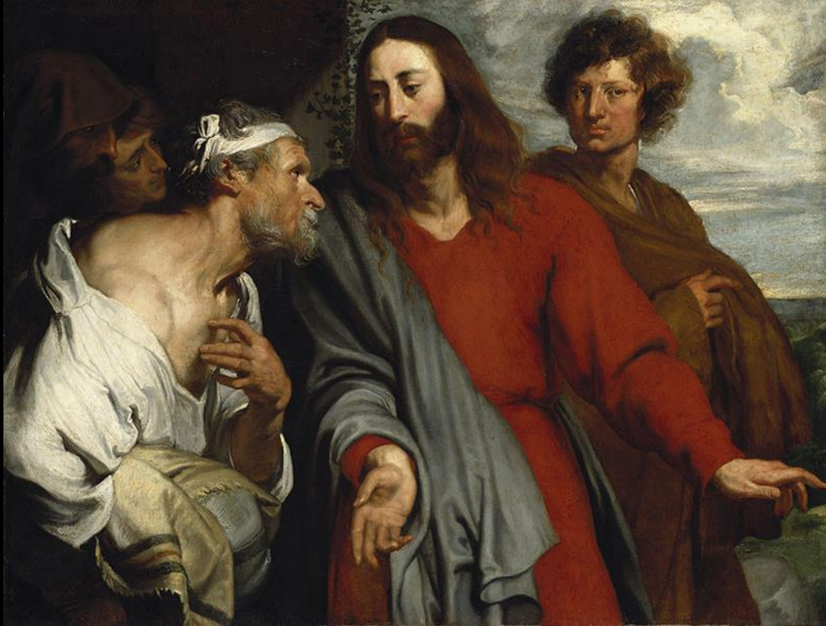
Healing of the Paralytic, Anthony Van Dyck, 1599-1641