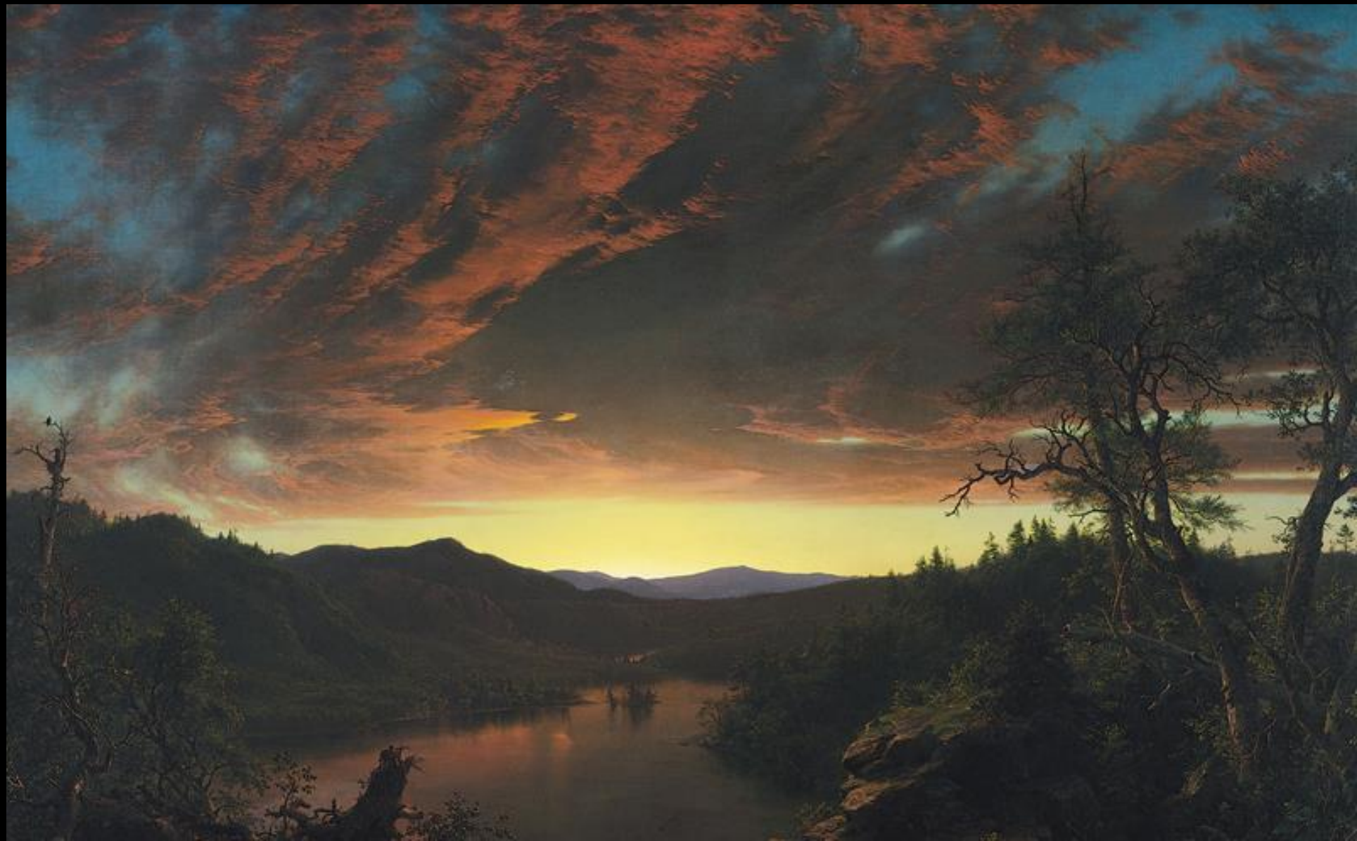
Twilight in the Wilderness, Frederic Edwin Church, 1860