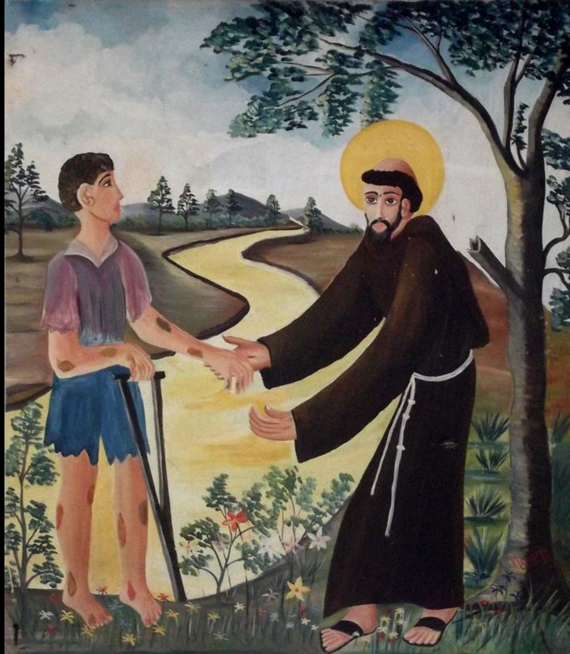
Priest reaching out to help a man with leprosy, Basílica de São Francisco das Chagas, 20 th century