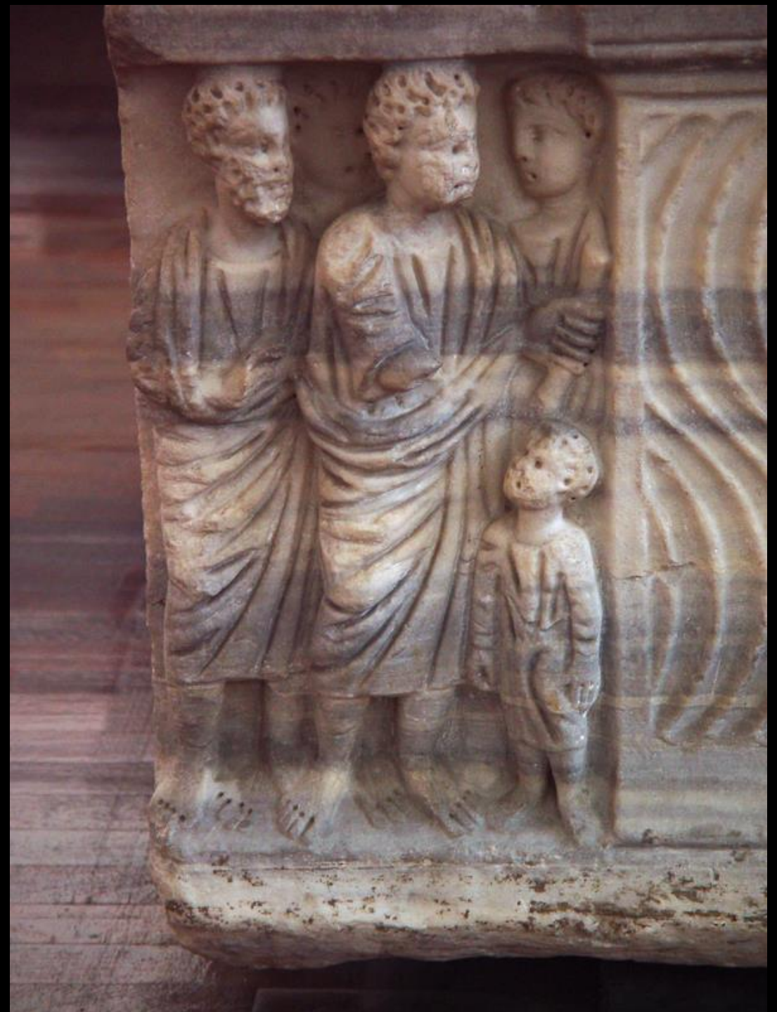
Christ in the Act of Healing Vatican City, 3 rd -4 th centuries