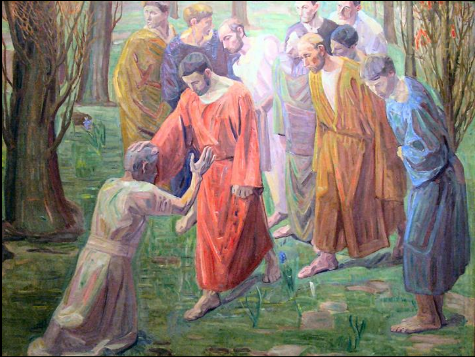
Healing of a Leper, Niels Larsen Stevns, 1913