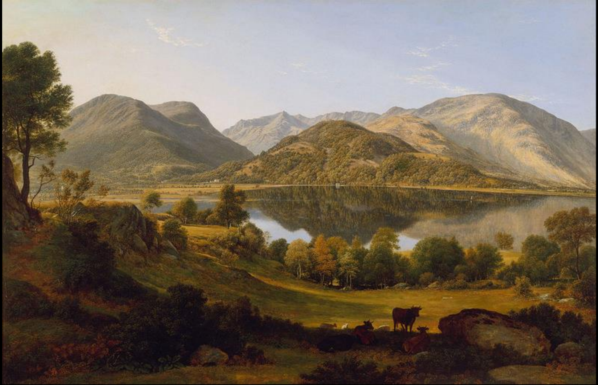
Ullswater, early morning, John Glover, ca. 1824