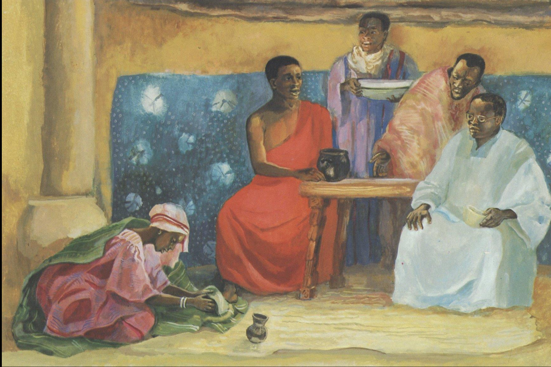
Jesus Speaks About Forgiveness, JESUS MAFA, 1973