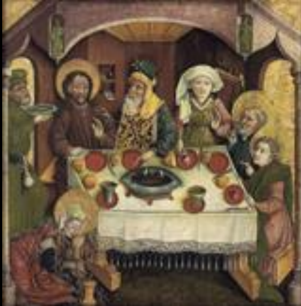
Anointing the Feet of Jesus in the House of Simon, the Pharisee, Allgau, Germany, ca. 1470-1480