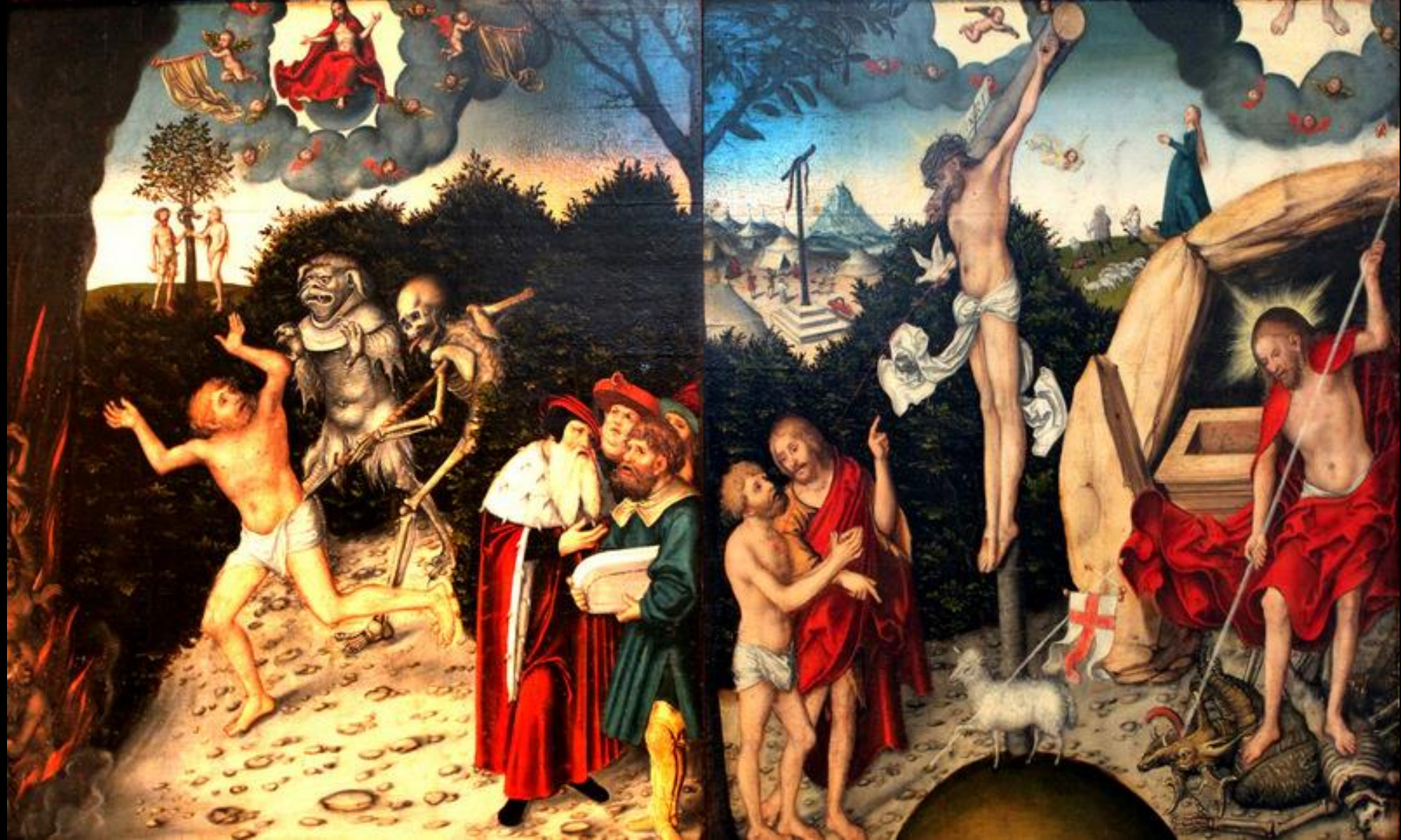
Allegory of Law and Grace, Lucas Cranach, 1529