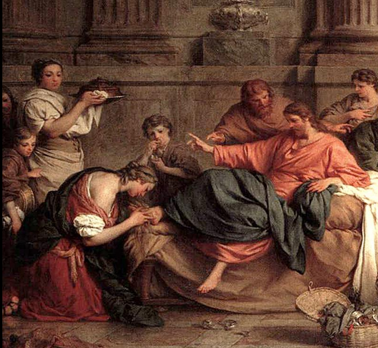
Anointing the Feet of Jesus in the House of Simon, the Pharisee Pierre Subleyras, ca. 1737