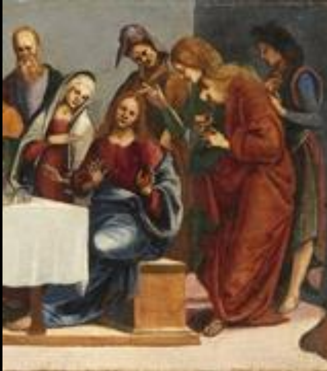
Anointing the Feet of Jesus in the House of Simon, the Pharisee, Luca Signorelli, ca. 1488-1490